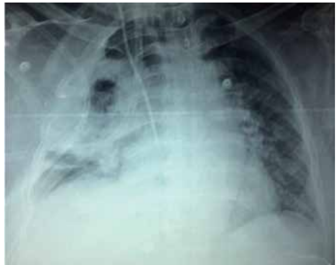
Figure 1. Bedside chest radiograph (postero-anterior view) revealed right-sided thick-walled cavitation and ground-glass opacity in both the lung fields.

Our patient was admitted to hospital with massive haemoptysis, fever and respiratory distress suggesting some acute infective process. She also had an episode